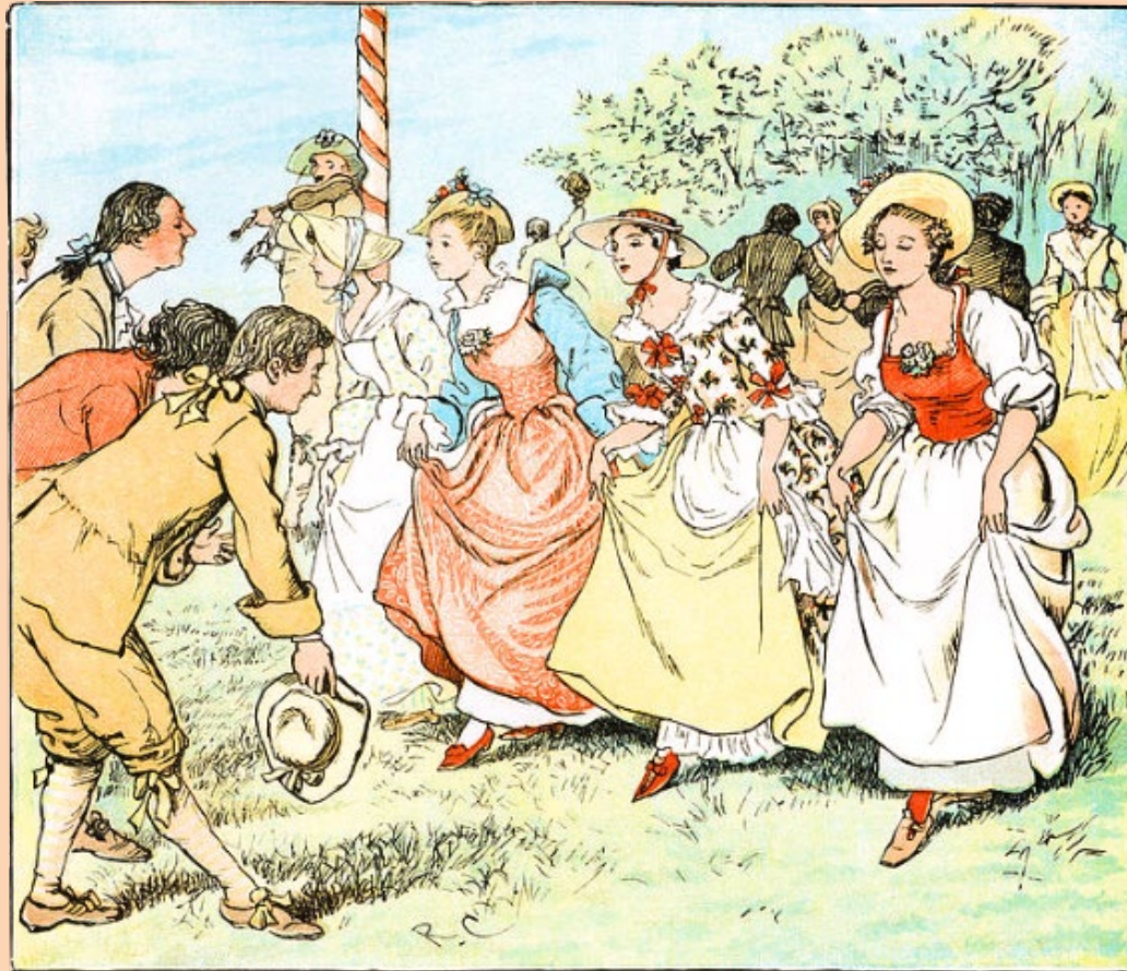
"May Day Dance" by British artist and illustrator Randolph Caldecott (1846 - 1886).