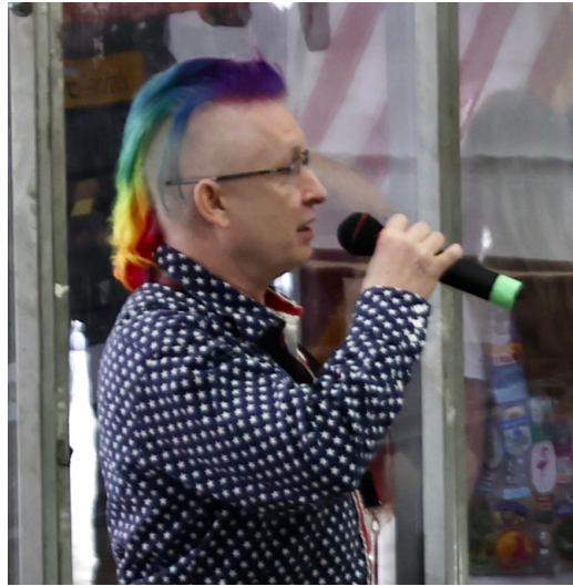
Singing the "Star-Spangled Banner" at Robogames

Greetings from the International Robogames! I am volunteering at this year's event rather than competing, putting my event-running skills to use to help the organizers keep things going smoothly and safely; it's amazing how much similarity there is between running Costume-Con and a robotic competition weekend (although costumes are less likely to actively attempt to destroy each other compared to combat robots). This year I was honored and privileged to perform the US national anthem in the opening ceremonies; a role for which I wore my "anthem shirt" of starred and striped bunting.