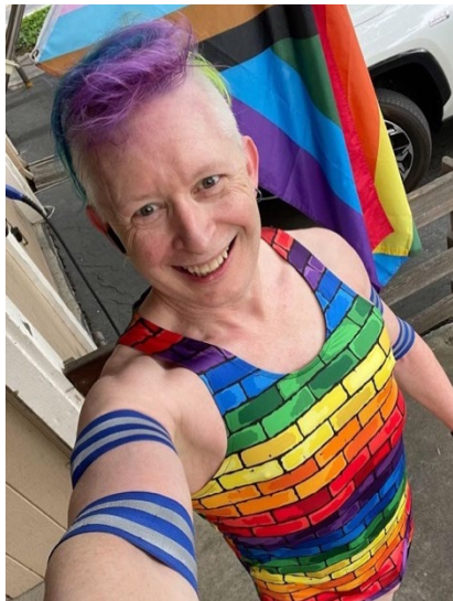
Silicon Valley Pride is August 27-29, so Happy Pride Again!

I’m signed up to be on a short collection of program items – one a costume-problem-solving Q&A panel, another on effective stage presentation, a reprise of my (reportedly very accessible and fun) Introduction to Quantum Computing, and a Table Talk (a beverage-free-because-of-the-pandemic equivalent to a kaffeeklatsch or Literary