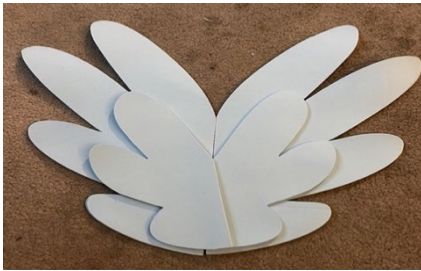
Signature 2-layer wings from EVA foam

Stay safe. Stay well. Make friends. Make beautiful things to wear and show off! And then share pictures with us so we can ooh and aah over them.