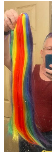
Clip-on rainbow ponytail fall

heart (and has mortifyingly supportive parents). She’s awesome. (I recommend the series even to adults; it’s a lot of fun, has a great girl-power centered writing, and an amazing voice cast.)