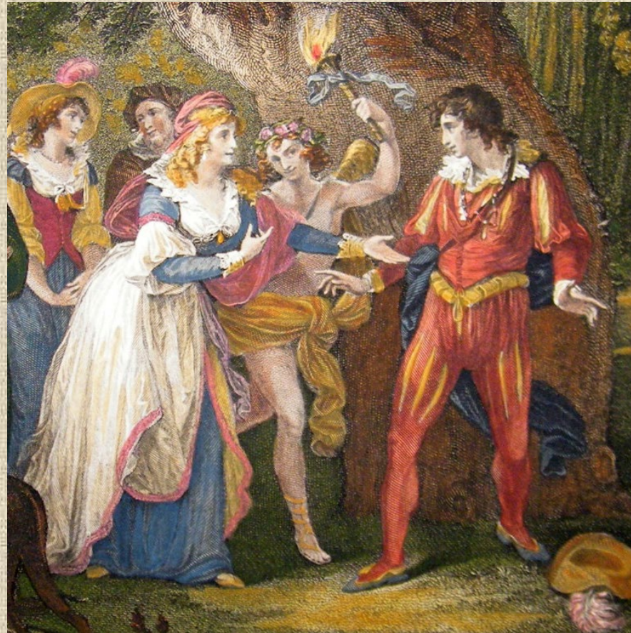
Painting of Shakespeare's "As You Like It" (1803)