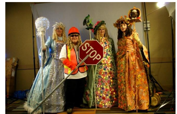
A Special Kind of Beauty.

Zero Dawn Best Grace Under Fire - Gru Zinkerbell from 'Despicable Me' So That's Where My Socks Went Award - Late One Night in the Laundry Room Best Musical - Tentacles Best Abstract - Hope Best in the Master Class - Disney in a Nutshell Best in Show Presentation - A Special Beauty