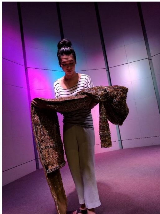
A woman holding the "Jewel of Thailand" dress at the Bangkok Contemporary Art Gallery

dress was incredibly heavy! Over one hundred artisans contributed to the construction of the dress.