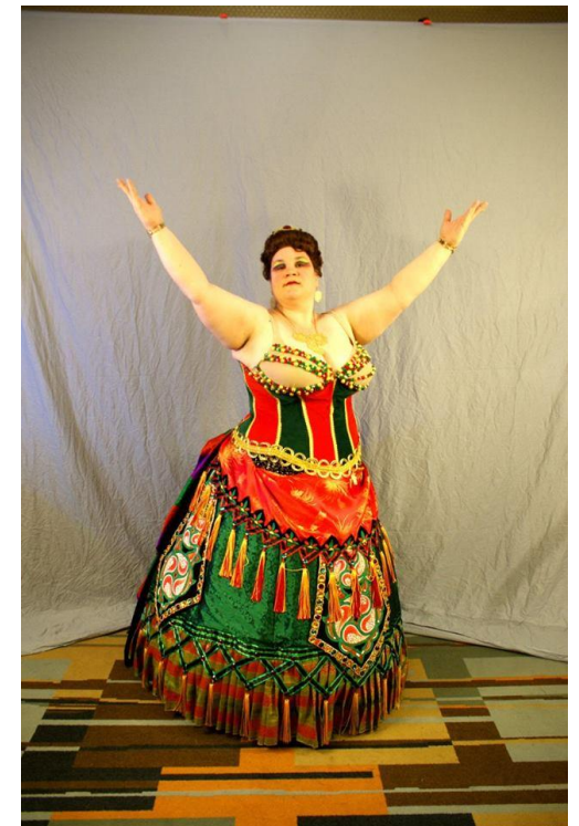
The Diva Strikes Back.

Honorable Mention for Timing - Rey (Star Wars) Best Anthropomorphic Characterization - Tarazet the Guardian Best Movement - Persona 5: Codename Queen Best Stage Presence - Lord of Isengard Best Characterization - Escape from Cannibal Island