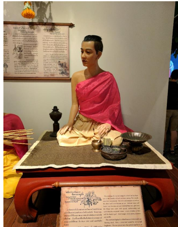
A woman of the court in the Rattanakosin period.

If anyone would like high resolution detail photos of any of these garments, please let me know! I have many!