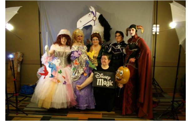
Disney in a Nutshell.

Zero Dawn Best Grace Under Fire - Gru Zinkerbell from 'Despicable Me' So That's Where My Socks Went Award - Late One Night in the Laundry Room Best Musical - Tentacles Best Abstract - Hope Best in the Master Class - Disney in a Nutshell Best in Show Presentation - A Special Beauty