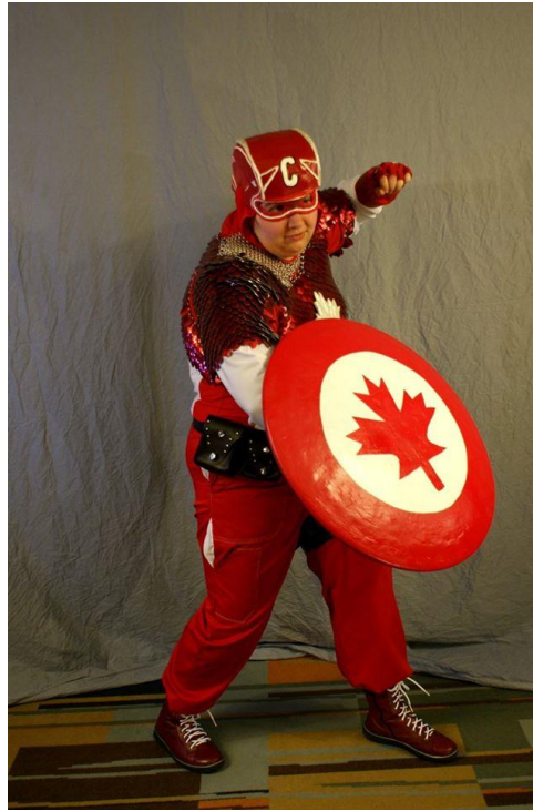
I am Canadian.