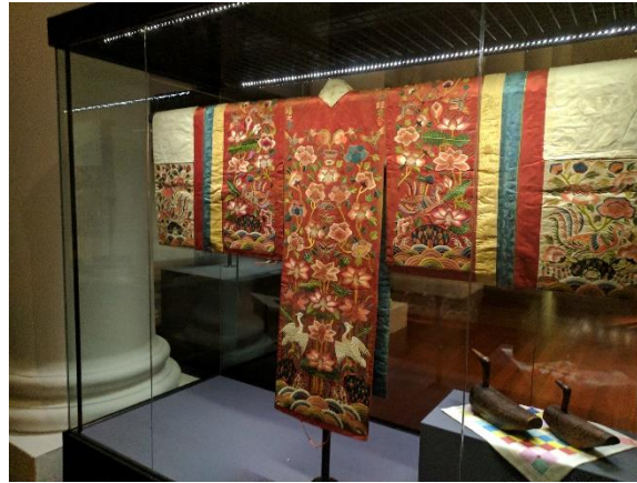
The back of an extant Korean wedding hanbok.

ogling over the garments, that I believe we made the guards nervous. They started watching us quite closely!