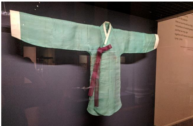
An extant Korean hanbok.