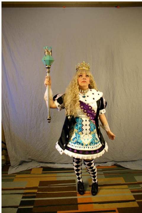
Here Comes the King.

Most Elvish - Amarantha Best Ambience - Badb - Wicked + Divine Most Intense - Ghost Rider Best Fictional Goddess - Maude Lebowski Best Murder Face - Maleficent Best Mascot Movement - Nicodemus Most Elegant - My Fair Lady Embassy