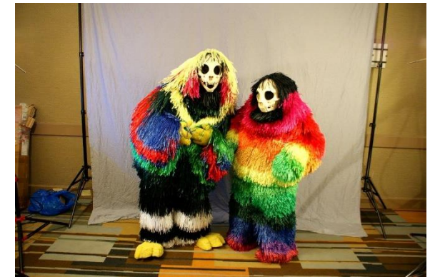
Late One Night in the Laundry Room.