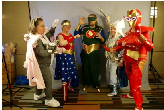
League of Older Female Action Heroes.

Most Prepared - Never Going to Happen Play of the Masquerade - The Wraith, the Muscle and the Devil Best Narrative - Expensive Journey Best Lipsynch - Don't Mess with Kefka We're All Going to Need Therapy Award - Once Upon a Nightmare Awards Rain from Above Award - Pharah Upcoming Netflix Original Award - LOOFA: League of Older Female Action Heroes Best Use of Stage Props - Aloy Horizon