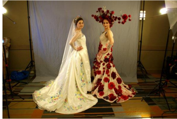
Weddings.

Best Royalty - Weddings Best Future Arsonist - Set the World on Wildfire Trixiest Trixie Award - The Trixie Show Most Otherworldly - Hana the Warrior