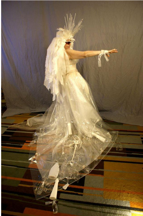
Hope.

Most Graceful - Lady Rainicorn Audience Appreciation - I am Canadian Most Regal - Once Upon a Costume-Con Most Energetic - Super Sailor Moon Best in Journeyman Class - The Diva Strikes Back