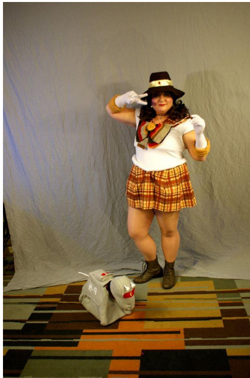
Sailor Who.

Best Wirework Jewelry - Titania, Queen of the Fairies