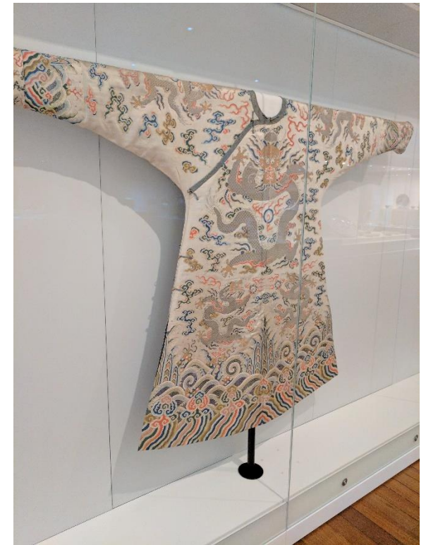
Dragon robe from the Qing Dynasty.

the Qing Dynasty, specifically the early 18 th century. It was worn during ritual occasions and during holiday celebrations.