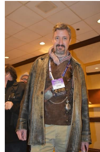
A War Doctor costume.

Each evening, there were gatherings with the "stars" and you could also pay for the privilege of an autograph or a picture. Saturday was much the same as Friday although we changed the rules of the scavenger hunt to finding the 3 photos in order to get a ribbon. After they had collected all 6 ribbons, then they could choose a charm. There were quite a few of the War Doctors wandering the halls and one reminded me of an ICG member: