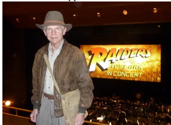
"Indiana Jones" shows up for a showing of "Raiders of the Lost Ark" in concert, with the Symphony Silicon Valley orchestra in San Jose, California in January 2016.