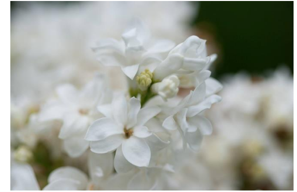
The Wonder of Nature.

Looking to be part of the action behind the scenes? Registering late and want to reduce the registration fee? Be part of our Workforce! We have volunteer opportunities for a wide variety of skills and interests: