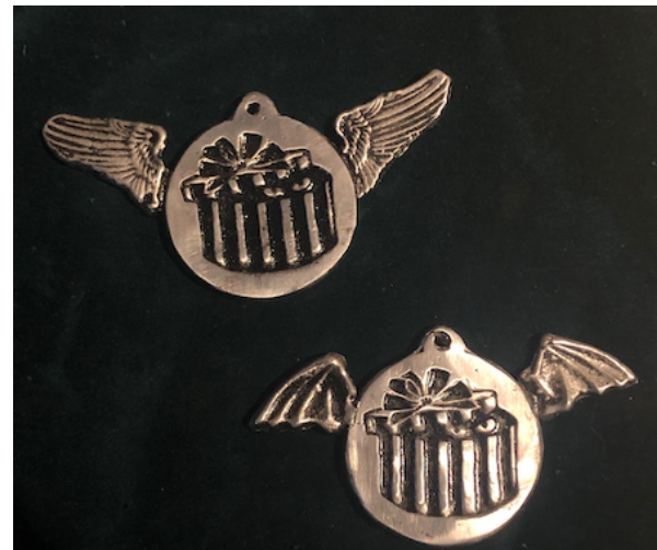
CC39 Angel Award (obverse)