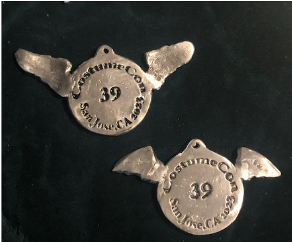
CC39 Angel Award (reverse)