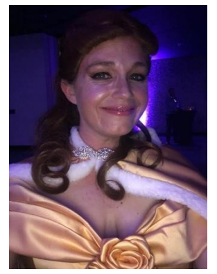
Winter Belle.

The sun is setting earlier in the evenings, and as the familiar nip of winter sets in and the crisp air fills with holiday scents, I hope everyone is enjoying their winter and holiday projects. This is my favorite season for crafting, especially presents, with all of the rich fabrics and textures that help me get into the spirit of this season of giving.