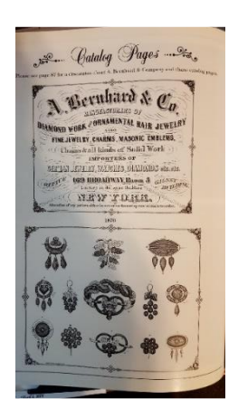
Catalog page from a Victorian-era catalog, showing a few of the jewelry designs that could be made for customers desiring to use their own hair, or a family member's hair, in a wearable piece of jewelry.

bracelets, watch chains, and brooches. They do not only signify death and mourning, but can be for friendship and love.