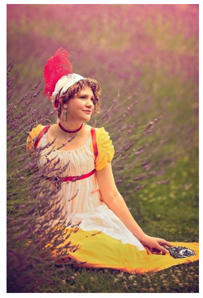
"Reign of Terror Belle"

The summer costuming season is upon us! For many, it's a break from the rush of all the Spring conventions and ConCrunch sewing. Others are gearing up for Renaissance Faires, SCA events, and reenactments while making room for summer vacations and family get togethers. The particularly ambitious