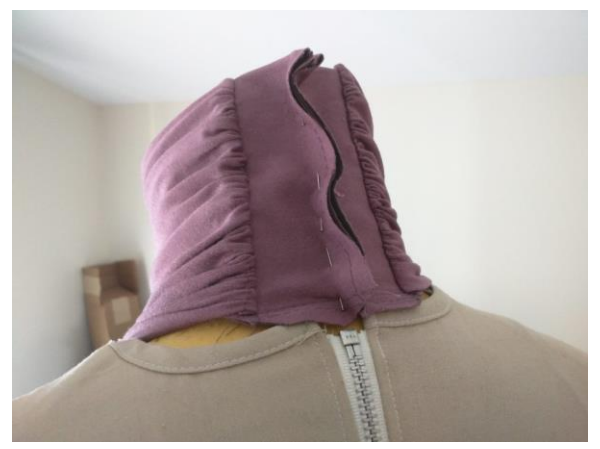
Collar back.

Press the entire thing some more and the collar is done.