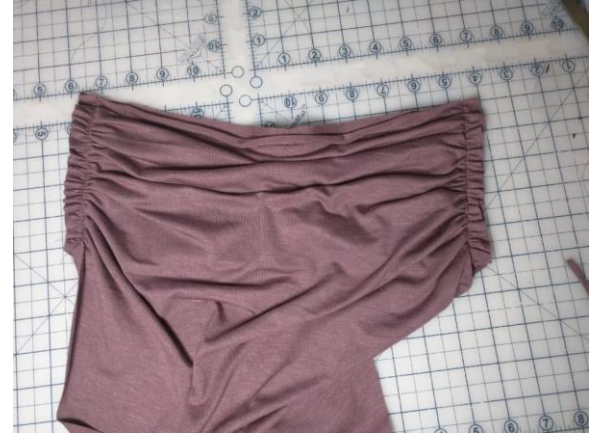
Gathering up the sides.

Baste your drape's side seams. Match up the top seams and stitch it down (don't sew over the collar back pieces!) Gather up the sides!