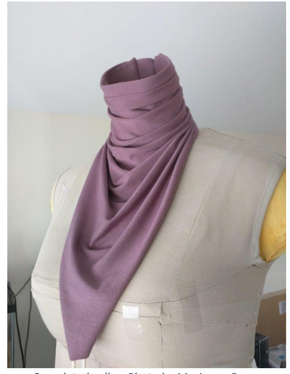
Completed collar.