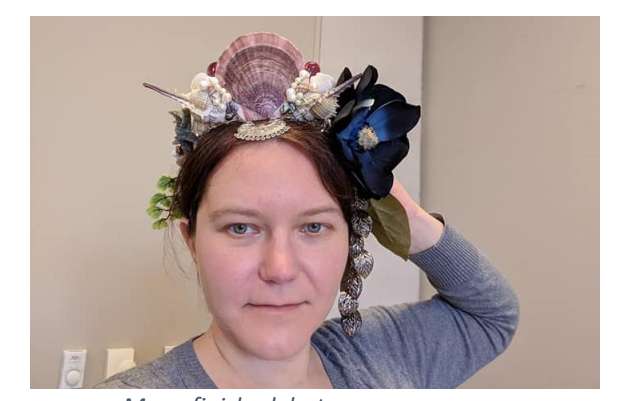
My unfinished, but awesome crown

Although I typically loathe winter, this one was full of costuming activity. I managed to get a lovely photoshoot in during a