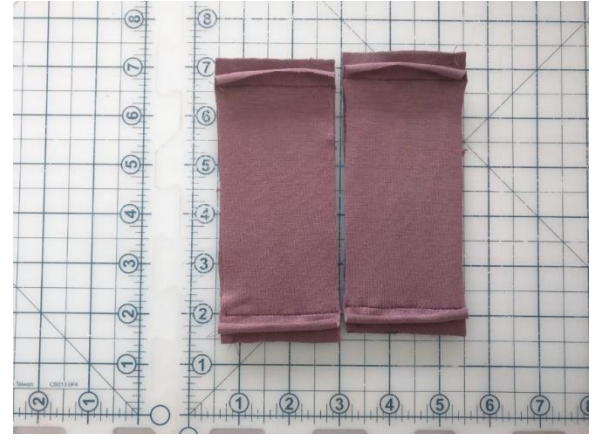
Collar back assembly.

Editor's Note: This article is adapted from Marianne's tutorial. The full text and pictures can be found at <a href="http://mariannepease.com/vice-admiral-holdo-collar-tutorial/">http://mariannepease.com/vice-admiral-holdo-collar-tutorial/</a>