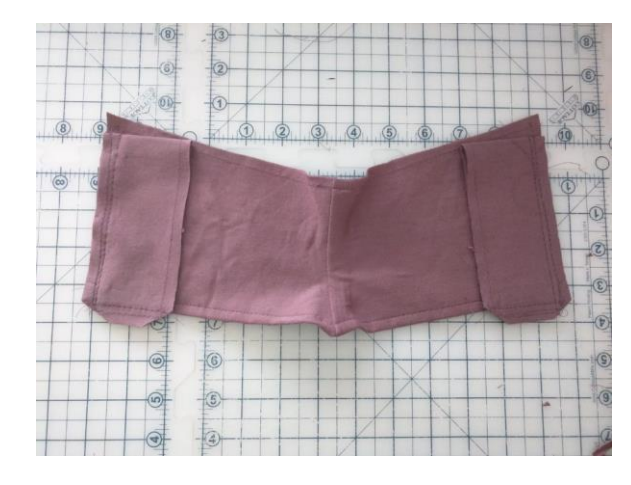
The collar is taking shape.

The collar back is almost ready to sew to the collar front. The lining sides of each layer are going to face each other. Baste along one edge that is going to be sewn down. This may seem like an excessive amount of basting but with a jersey like this it's easy to wind up with puckers when you're sewing if you're not careful.