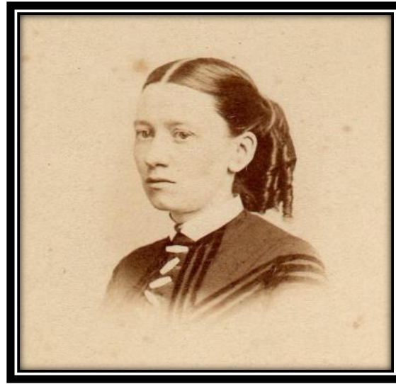
1860’s gem portrait of a lady with large oval shaped buttons—they appear to be carved wood.

Fashion and details at that time were primarily dictated by the most recent fashion magazines; Godey’s Lady’s Book and Peterson’s Magazine were popular examples, as was Arthur’s Magazine, but there were many other sources for new styles, and the market for fashion and society publications only expanded as the Victorian era progressed. (Another meaning for “transformation” was the not uncommon practice of completing a skirt (requiring the most fabric) with both a day bodice and an evening or fancy dress