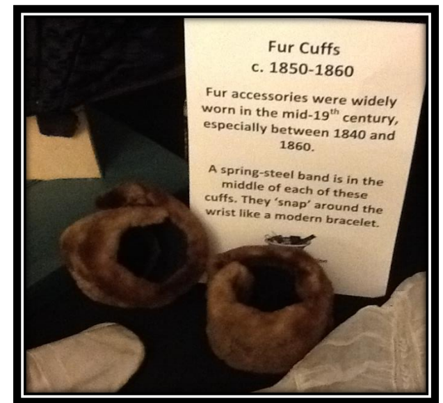
Fur cuffs, c. 1850-1860. Fur accessories were widely worn in the mid-19th century, especially between 1840 and 1860. A spring steel band is in the middle of each of these cuffs. They “strap” around the wrist like a modern bracelet.

Hats, bonnets and hoods: Obviously there were many different types available, and each could easily be personalized for the season, the occasion, the outfit, and the personal style of the wearer. Silk or embroidered flowers were popular, as were lacy bits, various colors and sizes of feathers, ruffled shapes, or pom-poms. Headwear of the 1860’s is a whole book unto itself. Needless to say, hats and bonnets could easily be re-used by replacing the embellishment. The profile would