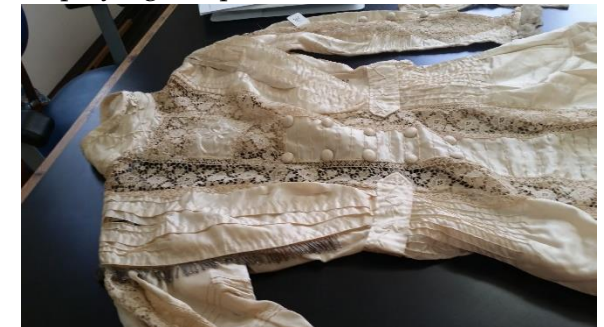
A dress from my personal collection. In good condition, but has some silk shattering.

On the final day of the course, we were able to document the condition of a piece from our personal collection. With the assistance of our classmates, and the instructor, who is a professional conservator, we also formulated plans for cleaning, storing, and displaying our pieces.