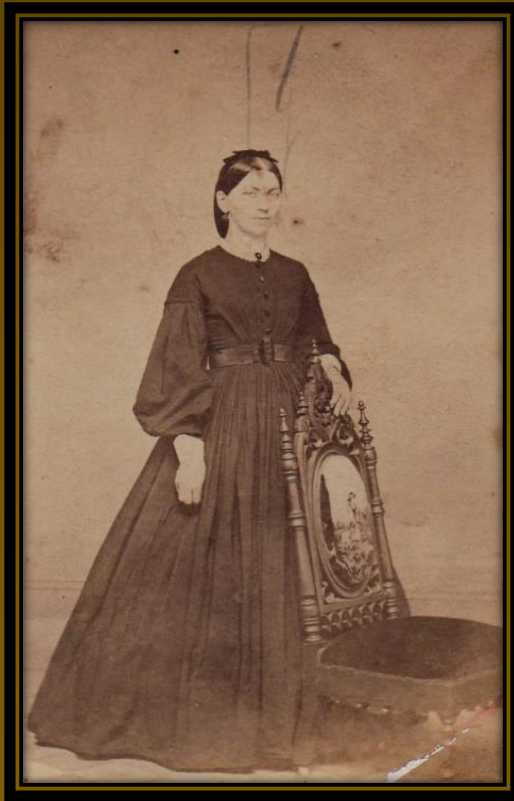
Lady with a rather plain solid dress but her belt appears to be the same color, only a shiny fabric with a center buckle.