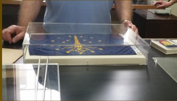
Safely displaying historic textiles.