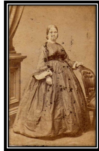
1860's CDV of a lady with a very full skirt, very puffy undersleeves under pagoda sleeves, and a Swiss belt, attractively defining her waist.