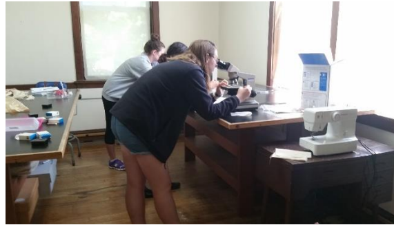
Identifying fibers through microscopy.

Formerly known as the Campbell Center, IPSC has multiple preservation courses on everything from textiles to masonry. In the Introduction to Textile Preservation course, we learned how to identify fibers via microscopy, what types of treatments are considered best practices for museum preservation, and things to think about when exhibiting or displaying textiles.