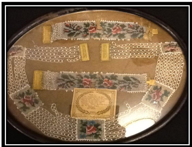
Seed bead woven floral matching bracelets and belt, apparently a wedding gift or trinket, 1860's; part of rotating exhibit at the Conference.

Fans: could be made of a multitude of materials, silk, bamboo, feathers, paper, or cardboard, and could be embroidered, painted or decorated with lace, beads, etc. Fans were generally an accessory for use with a ball gown rather than day dress. They were sometimes used as autograph “albums”, and some are known that were paper printed with photographs.