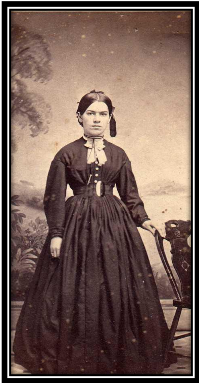
Lady with fashionable cravat tied around the collar and wide belt with a large, dramatic buckle.

Wristlets: which could be worn over the ends of sleeves with no cuffs, were commonly made of ribbon, either silk or velvet, beaded or not, as an “ornamental finish”. Sometimes they were called “velvet bracelets” and could be decorated with a ruffled flower or silk embroidery. Elastics were frequently employed to wear them; they could also be worn over the tops of gloves or attached to the gloves themselves, or a small buckle could be used, which doubled as decoration.