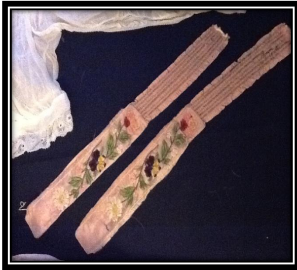
Elastic garters from the 1860's, with hand embroidery on pink silk.

Collars and Cuffs: a tremendous diversity of these items existed, and were made at home. Every type of fabric from plain cotton and linen to fancy laces, homemade crocheted laces, leather, fur, and silk was used. Patterns abounded in the journals for collar and cuff patterns, from a gauntlet cuff, rounded, edged with contrasting or similar color or lace, beaded patterns, embroidery with cotton, wool or silk threads; the variations were truly endless.