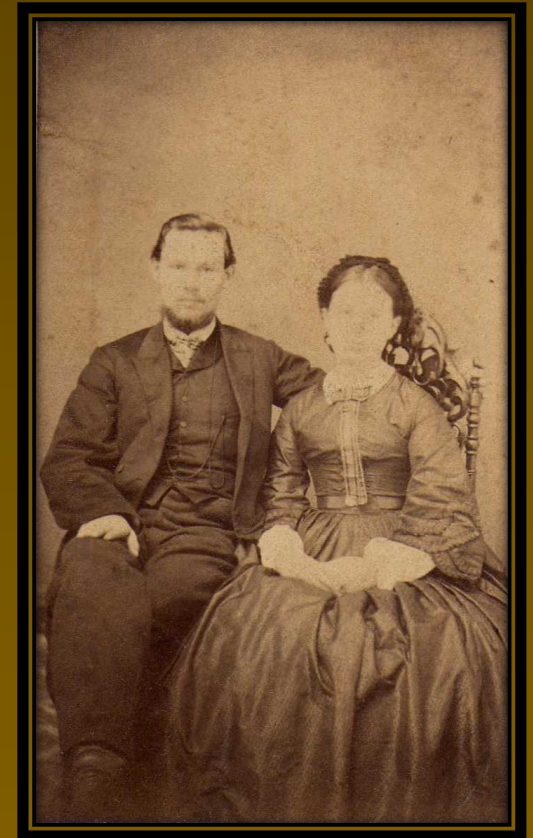
Rather plain undersleeves visible with pagoda sleeves, Courtesy of Lisa Ashton.