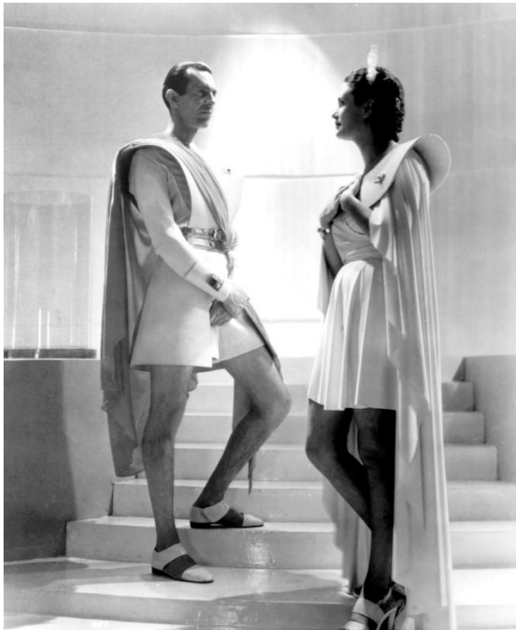
The sci-fi movie, Things to Come (1936), inspired Forry's and Morojo's costumes.