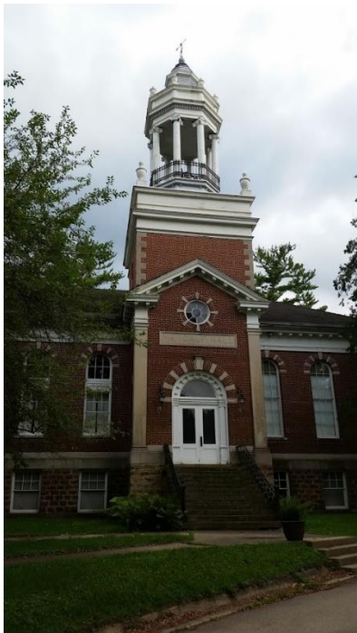
Metcalf Hall. One of the buildings on the IPSC Campus.

Nestled among the cornfields and small towns of Northwestern Illinois is a little gem – The International Preservation Studies Center (IPSC). Located in Mount Carroll, Illinois, the center exists to educate people, mostly museum professionals, in best practices for preservation. The programs are hands-on, and unlike any other programs in the world. This past July, I had the opportunity to take a course on Textile Preservation.