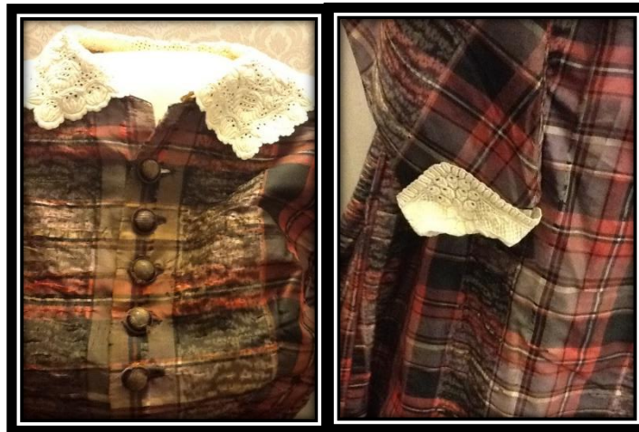
Photos of matching whitework embroidery cotton collar and gauntlet pointed cuffs on a brown plaid silk 1860's dress

Ladies Cravats and Neckties: Godey's Lady's Book from June 1864 mentions that "the latest styles for silk and muslin neckties for gentlemen and ladies has the initial embroidered on the ends". These