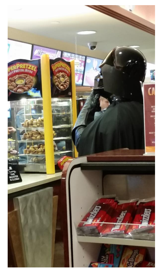
A Darth Vader costumer chooses between popcorn and pretzels.

Be sure to keep an eye on the Costume-Con 34 website and Facebook page for updates, videos, and information about the Madison area.