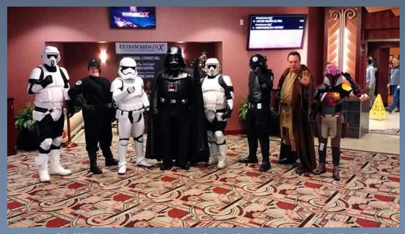
Members of the 501<sup>st</sup> Legion - Wisconsin Garrison at the Star Wars Episode VII premiere.