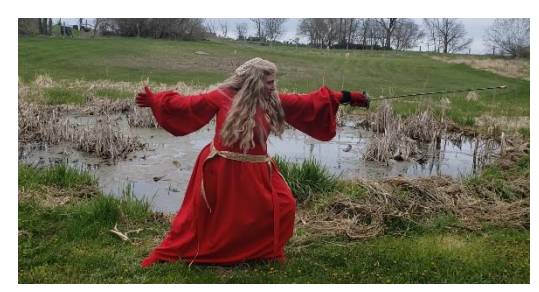
Princess Bride cosplay and

I know a few of you noticed that with the last newsletter we started with Volume XX. That is a fair amount of time for a newsletter and I'd like to send both a thank you and a congratulations out to everyone who has ever been a part of putting the International Costumer together: editors, contributors, proof-readers, online tech and the readers.