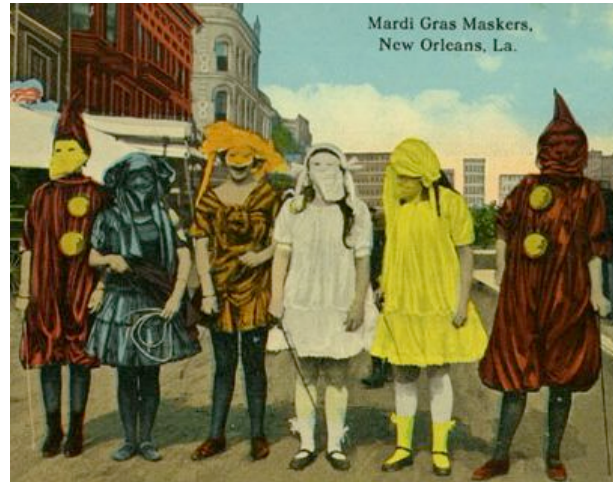
1915 Mardi Gras Maskers.

I look forward to seeing you at the ICG Annual meeting. If you have any concerns or questions, please don't hesitate to contact me by e-mail or phone. I normally respond to e-mail messages within 24 hours, so if you don't get a response, please resend it.